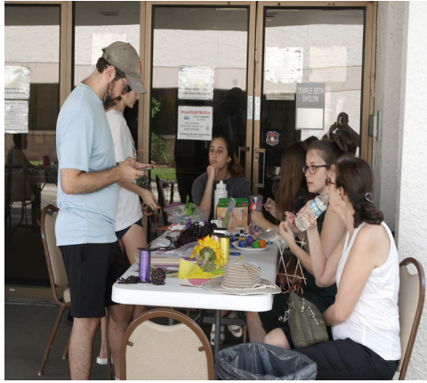
Photo Above TBS Youth Group preparing decorations for the Sukkah