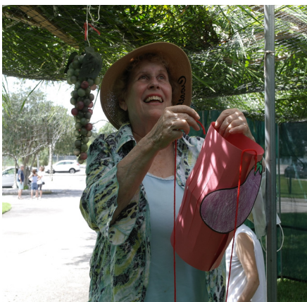
Photos Below TBS' Sisterhood decorating the Sukkah