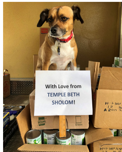
Photo Left: TBS' resident canine staff member, FinnLee, poses with some of the generous donations TBS has received that were given to the Salvation Army this past month!