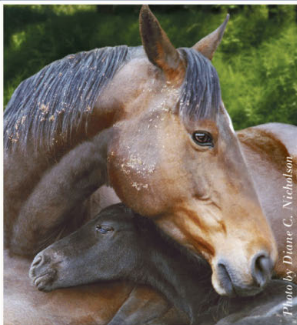
Sahali, the only foal of Kechena, a rescued Secretariat granddaughter, 23 hours after birth.